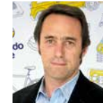
Marcos Galperín CEO Mercado Libre Chair B20 Task Force Digital Economy and Industry 4.0