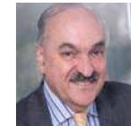
Pedro Villagra Delgado G20 Argentina Sherpa