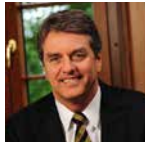
Roberto Azevedo Director General World Trade Organization