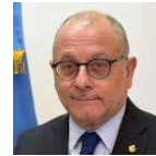
Jorge Faurie Argentine Minister of Foreign Affairs and Worship