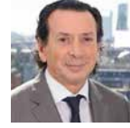
Dante Sica Argentine Minister of Production and Labour