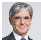
Joe Kaeser CEO Siemens