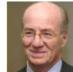
Paolo Rocca President Techint Group Chair B20 Task Force Trade and Investment