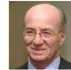
Paolo Rocca President Techint Group Chair B20 Task Force Trade and Investment