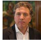
Nicolás Dujovne Argentine Minister of Treasury