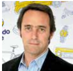
Marcos Galperin CEO Mercado Libre Chair B20 Task Force Digital Economy and Industry 4.0