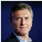
Mauricio Macri Argentine President and G20 President